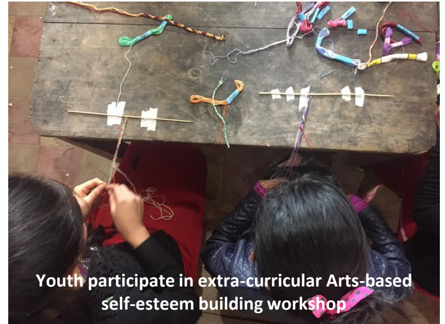
Youth participate in extra-curricular Arts-based self-esteem building workshop