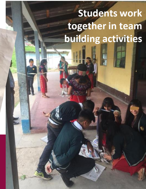
Students work together in team building activities