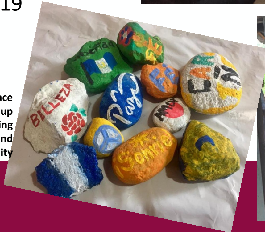
International day of World Peace the arts-based youth group participated in a rock painting activity to help spread peace and friendship in the community