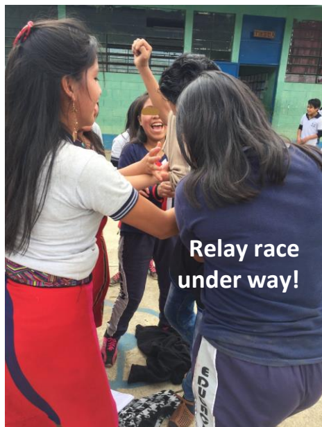
Relay race under way!