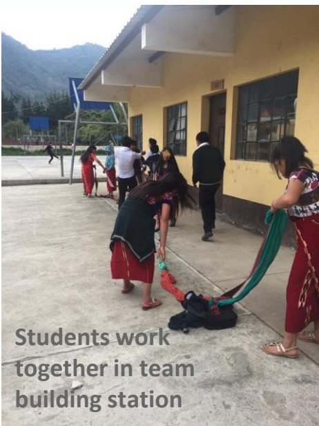
Students work together in team building station