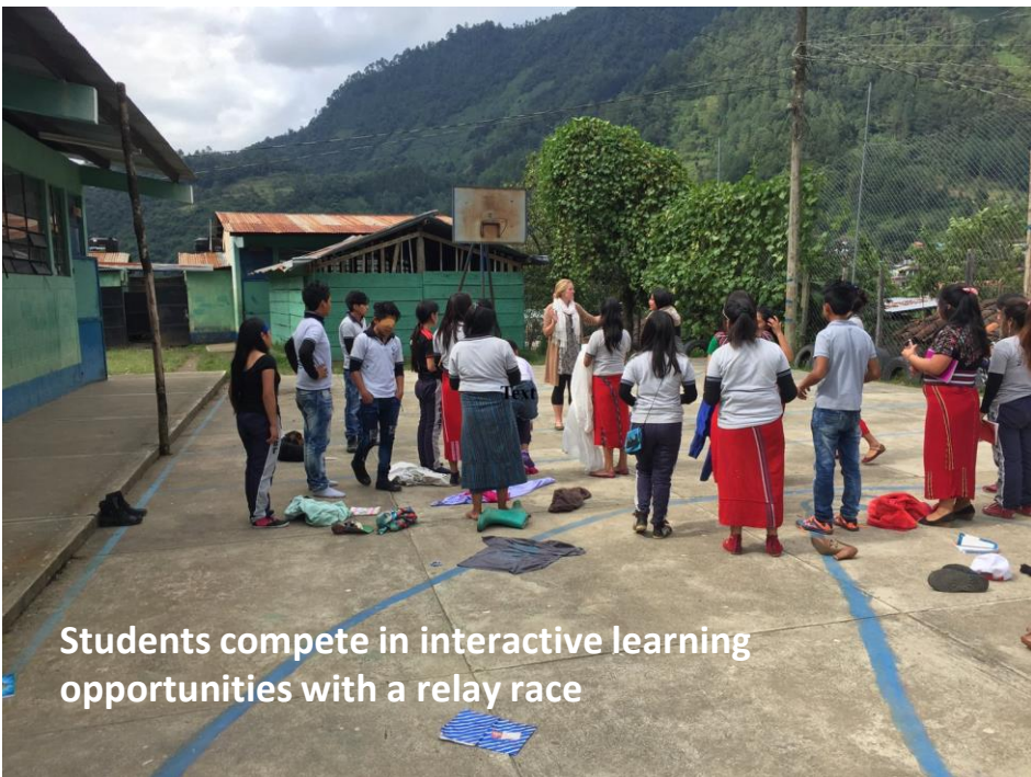
Students compete in interactive learning opportunities with a relay race